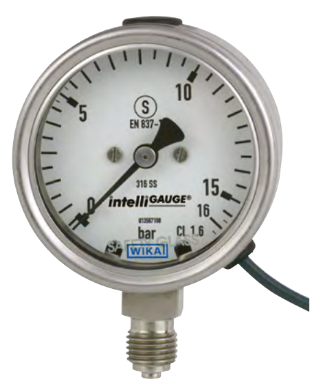
intelliGAUGE, model PGT23.063