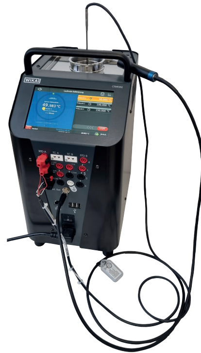
CTD9350 as an application with an external reference thermometer

As gradients over the first 40 mm [12.58 in] above the bottom provide the largest contribution to the measurement uncertainty, these are therefore also specified in the data sheets.