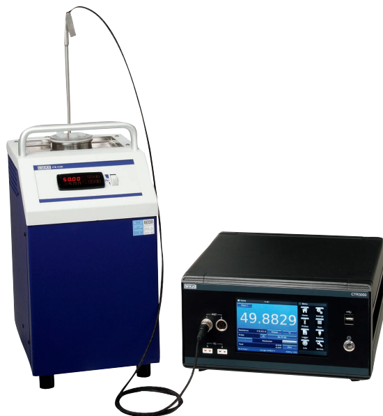
Temperature dry-well calibrator model CTD9100 with precision thermometer model CTR3000